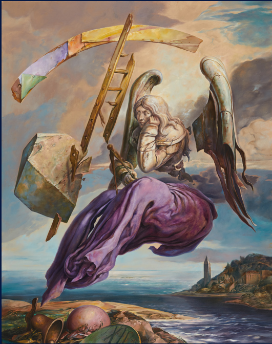
Samuel Bak, Dürer's Flight (Rainbow) , 1989, Oil on linen.