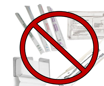
uncontaminated packaging and paper towels