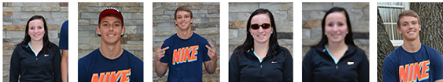
No Other Objects